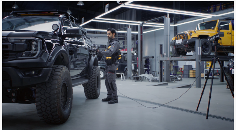
A Man Using Trackit to Scan An SUV