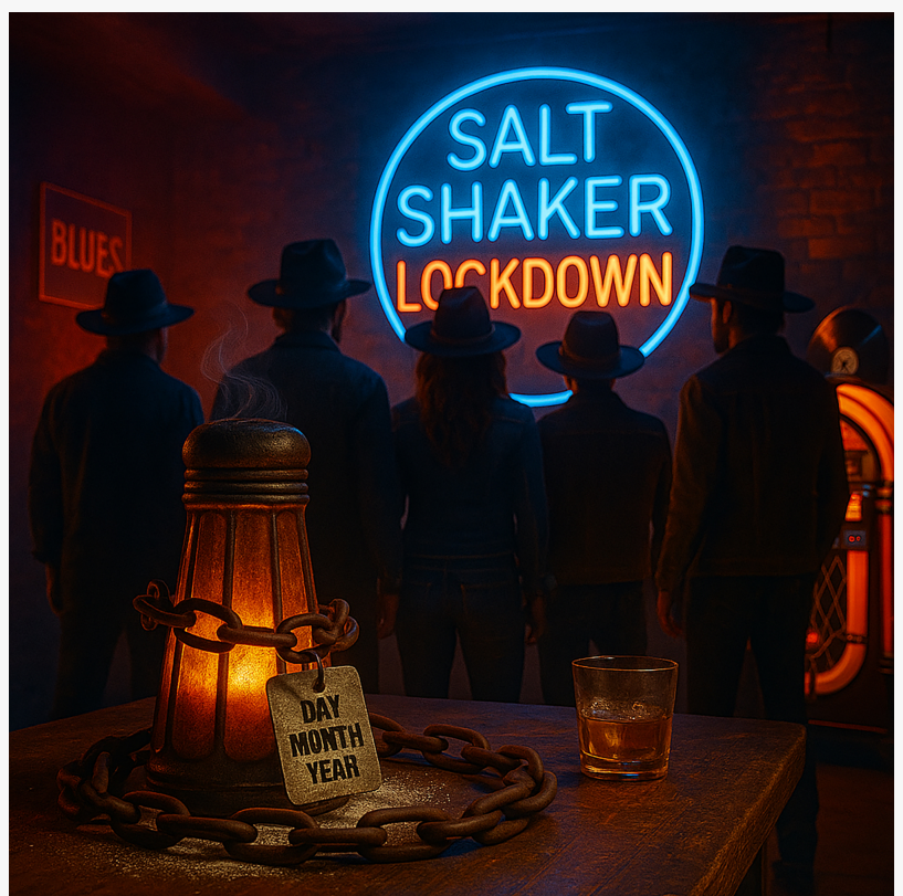
Salt Shaker Lockdown releases Day Month Year

Their music tells the truth. Not the polished kind—but the kind you carry with you after a hard goodbye or a perfect night. These are songs for dreamers, drifters, and diehards. They speak to the moments that define us—love that endures, friends that become family, and the quiet spaces where faith and doubt collide.