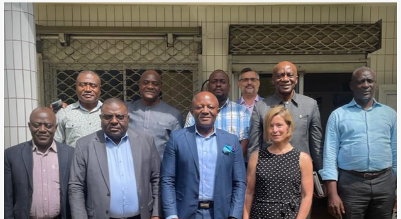
Accelerating Climate-Resilient Growth: Facet Power and PAMOL Plantation Strategic Partnership to Scale Food-Energy-Water-Carbon Synergies in Cameroon

WILMINGTON, DE, UNITED STATES, April 30, 2025 /EINPresswire.com/ -- In a landmark partnership, Facet Power , Inc., a global leader in Complete Climate Solutions and Energy Ecosystems, has joined forces with PAMOL Plantations Plc, one of Cameroon's leading agricultural enterprises. This transformative initiative seeks to redefine agricultural sustainability and local economic growth by turning waste into a catalyst for climate-positive innovation, natural capital and community regeneration, and inclusive opportunities for climate prosperity.