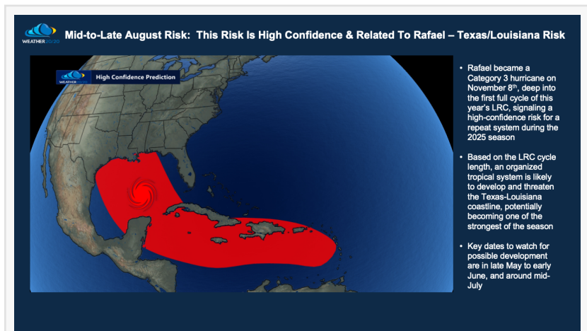
High-Confidence Hurricane Risk: Texas–Louisiana Threat in Mid-to-Late August