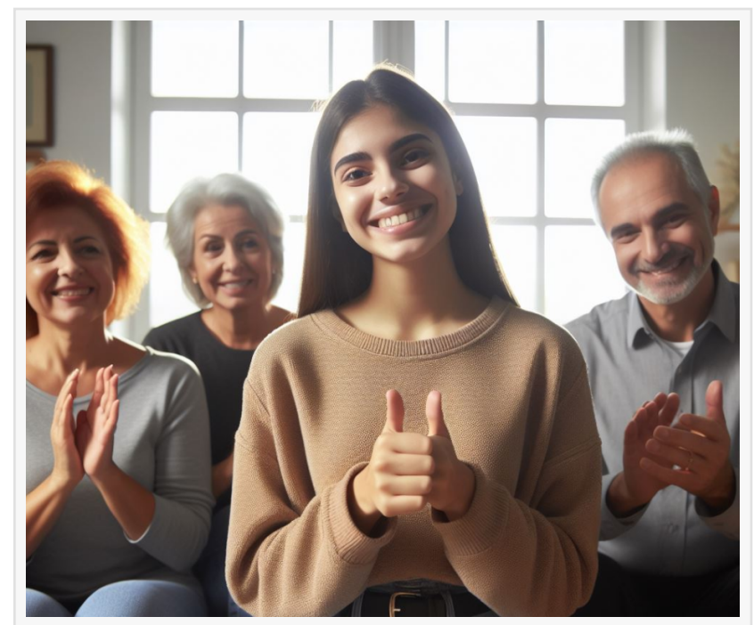
Intelligent tech wearables are an important part of recovery today

This press release can be viewed online at: https://www.einpresswire.com/article/807824040