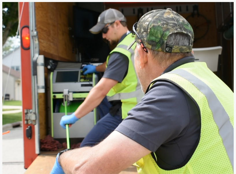
Insight Vision Cameras in Action

About Insight Vision: Insight Vision is the leading-edge manufacturer of sewer camera inspection systems for industry professionals. It is an innovative company that designs advanced push cameras and crawler systems that offer high-resolution imaging, advanced navigation capabilities and real-time data transmission. Its camera technologies are often used for specialized applications across different industries, including pipe inspection, sanitation, HVAC