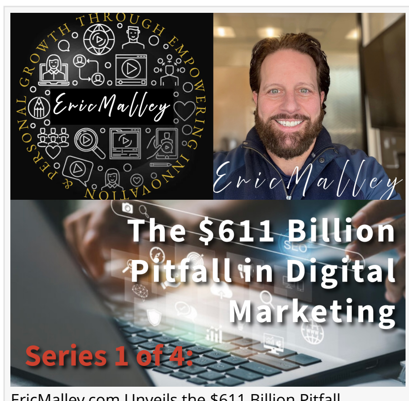
EricMalley.com Unveils the $611 Billion Pitfall