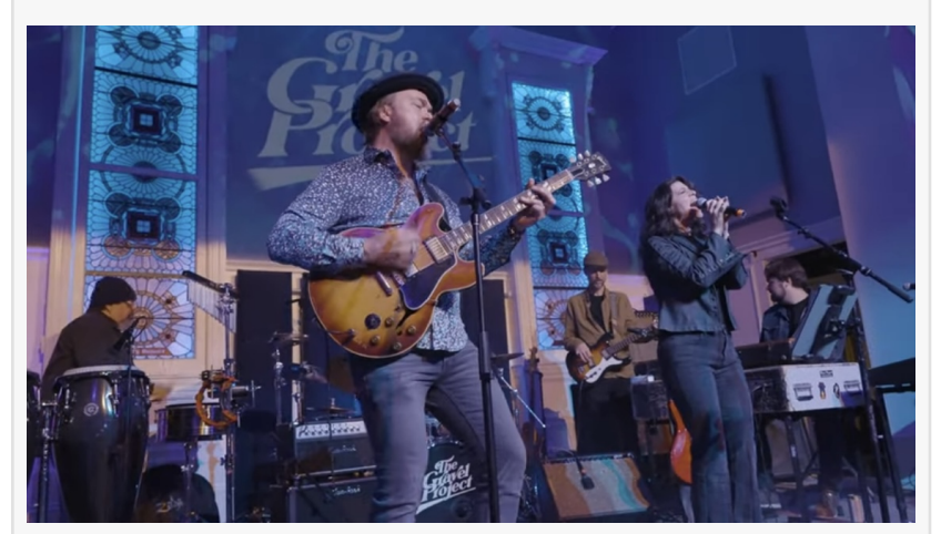
The Gravel Project

The Gravel Project and the upcoming shows, you can visit their website at <a href="https://www.thegravelproject.com">https://www.thegravelproject.com</a>.