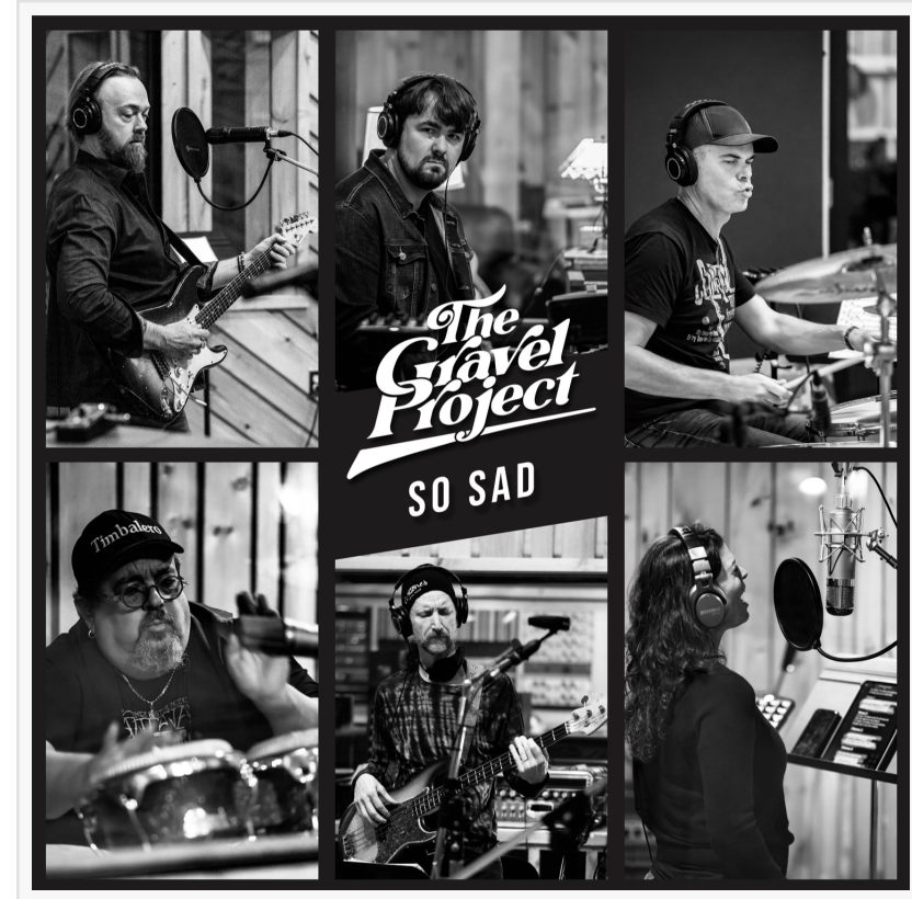
So Sad was release on April 24, 2025

"So Sad" is currently available on all major streaming services including Spotify®, Apple Music, Tidal, Pandora, and Amazon Music. If you are in the Northeast USA, be sure to check the band's calendar on their website to catch a show. To find out more about