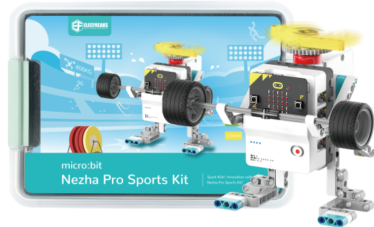
Nezha Pro Sports Kit

The Nezha Pro Sports Kit is an innovative product that seamlessly blends fun and education. Within a sports context, children can build over 20 types of robot models, including weightlifting, rowing, rope skipping, and basketball shooting robots. The initial inspiration for developing this kit came from the Olympics, combined with Europe's current education policy promoting youth sports. This led us to explore how to merge the fun of coding with sports. By integrating programming knowledge into these projects, abstract concepts become tangible and engaging. The kit supports a no master control mode, making it easy for children with no prior programming experience to get started quickly and experience the joy of creation.