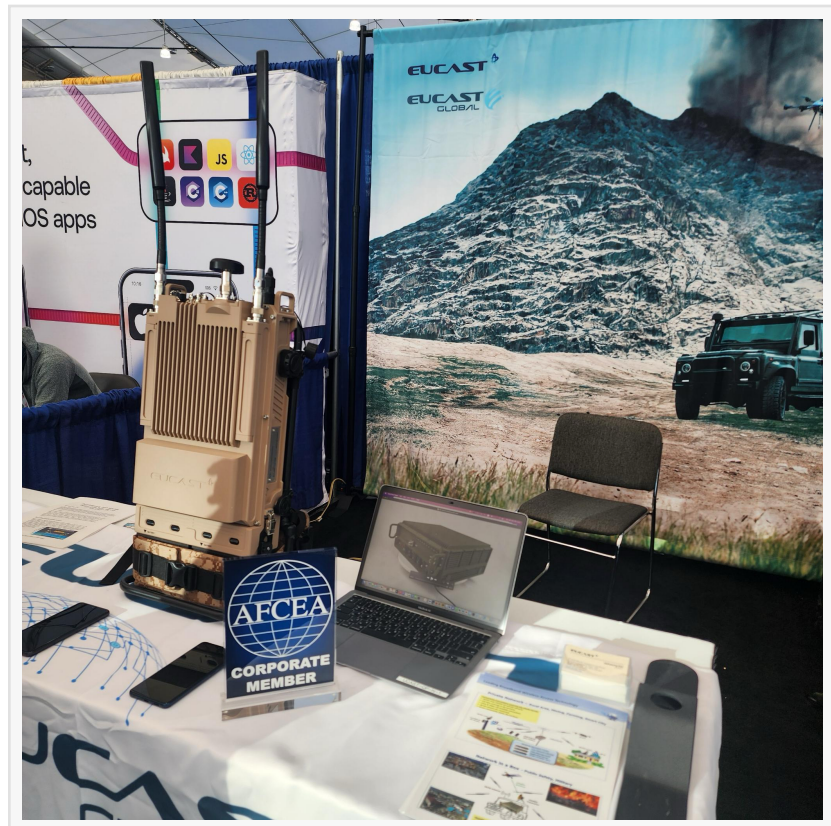
EUCAST's revolutionary Network in a Box (NIB) technology

EUCAST Global provides end-to-end advanced wireless access solutions including base stations, application servers and gateway, core network, network management systems, and user devices. EUCAST has been a leading force in the advanced wireless access technology marketplace for more than a decade.