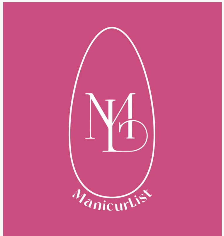
ManicurList: Your Personal Nail Art Organizer