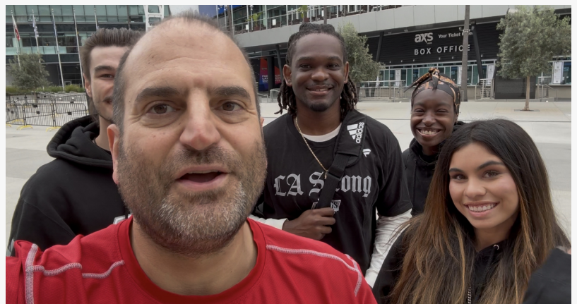
TravelingWiki Foundation Spends Today with Los Angeles Kings Promo Team to Raise Awareness for Special Needs Resources

with community service organizations such as the Jewish Community Center Leadership, TravelingWiki Foundation's spent today with the Los Angeles Kings Promo Team (at LA Live with ESPN, Delta Airlines, Marriott, NBCUniversal, BlueCross & More) as search volumes now exceed