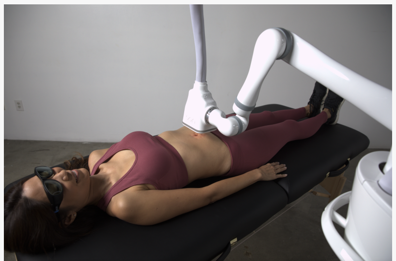
EON Tennessee Announces The Revolutionary EON Device

Anyone looking to permanently reduce stubborn fat in the upper / lower abdomen, flanks, back, or thighs. People looking for a non-invasive solution for body sculpting that doesn't interrupt their normal daily schedule. Manageable BMI of 30 or less No contraindications and precautions acknowledged People able to "pinch an inch" in the treatment area