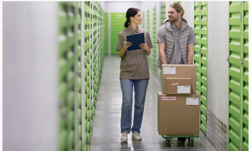
storage renters insurance.