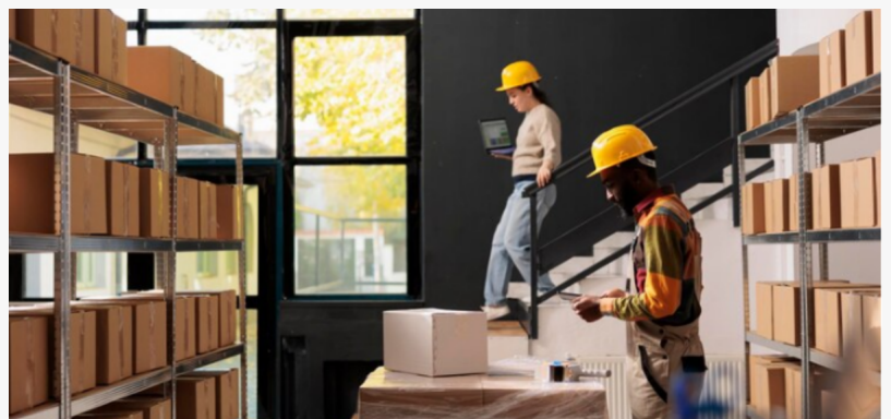
insurance for storage units.