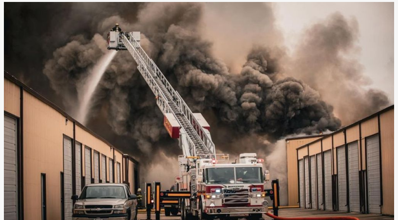
smoke insurance for storage units.