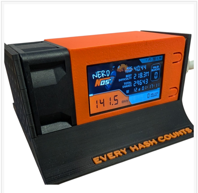
Nerdminer NerdNOS Solo Bitcoin USB Miner

With its compact form factor, silent operation, and energy efficiency, the