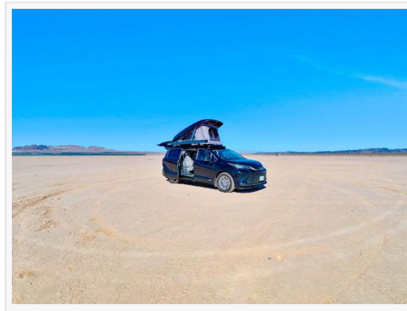
UNICAMP TOYOTA SIENNA EXTERIOR VIEW

"This launch represents a major milestone for us," said a spokesperson for UNICAMP USA. "We've listened to our customers, worked hard on the engineering, and we're proud to finally