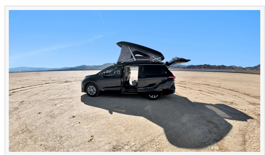
UNICAMP TOYOTA SIENNA EXTERIOR

Following the successful launch of the Unicamp Carnival Pop Top Camper, demand from van life enthusiasts and families across North America made it clear: the Toyota Sienna needed the same innovative treatment. After over a year of meticulous development and real-world testing, UNICAMP is now delivering converted customer vehicles—bringing versatility and