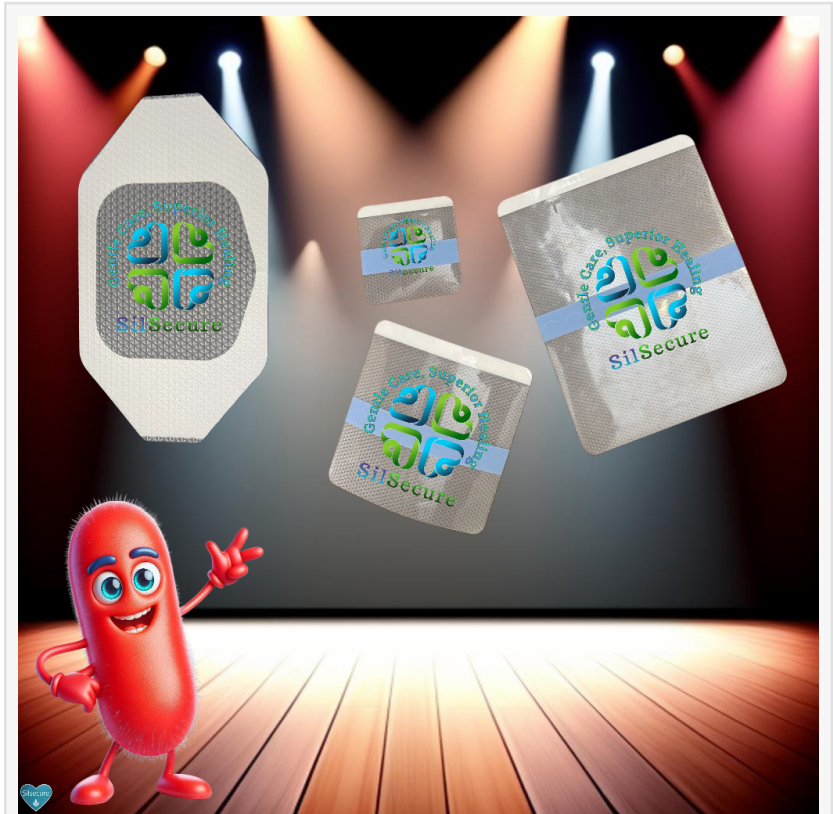
SilSecure current products

Chronic wounds and infections impact millions of patients worldwide, often leading to prolonged hospital stays, reduced quality of life, and, in severe cases, life-threatening complications. For caregivers and healthcare providers, the challenge lies in finding dressings that are effective, gentle on the skin, and easy to apply and remove.