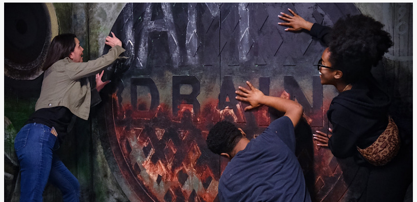
Down the Drain