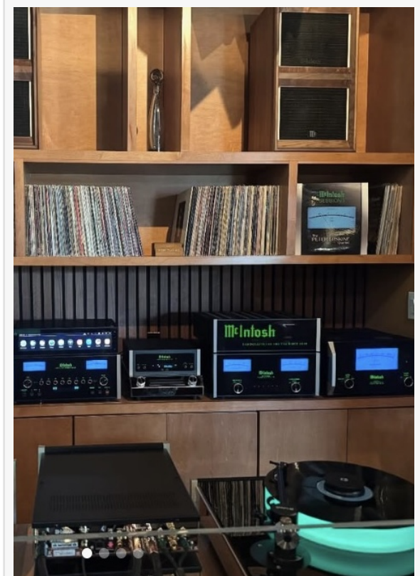
McIntosh HiFi System

This trend isn't limited to Japan and the UK. In the United States, cities like New York have seen