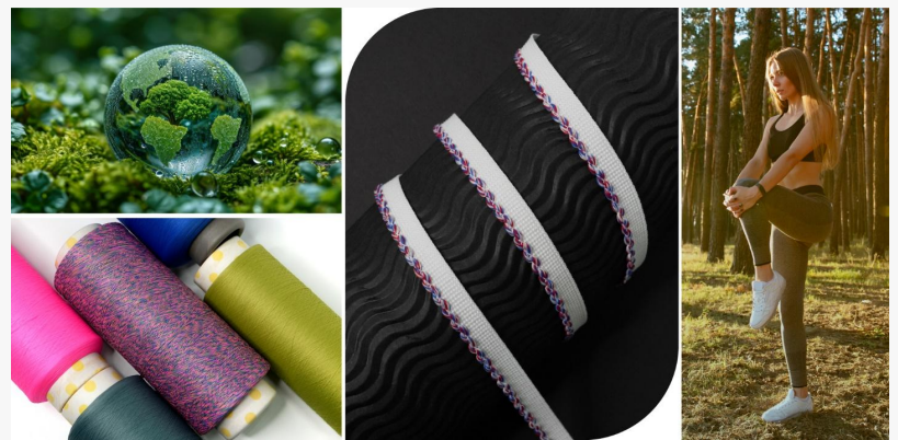
Fancy Yarn used In Selection of Products

ECI Elastic continues to advance sustainable textile production by utilizing recycled materials and implementing eco-conscious manufacturing processes. The company's broader sustainability strategy includes carbon footprint reduction initiatives and circular economy practices aimed at improving environmental responsibility across the textile supply chain.