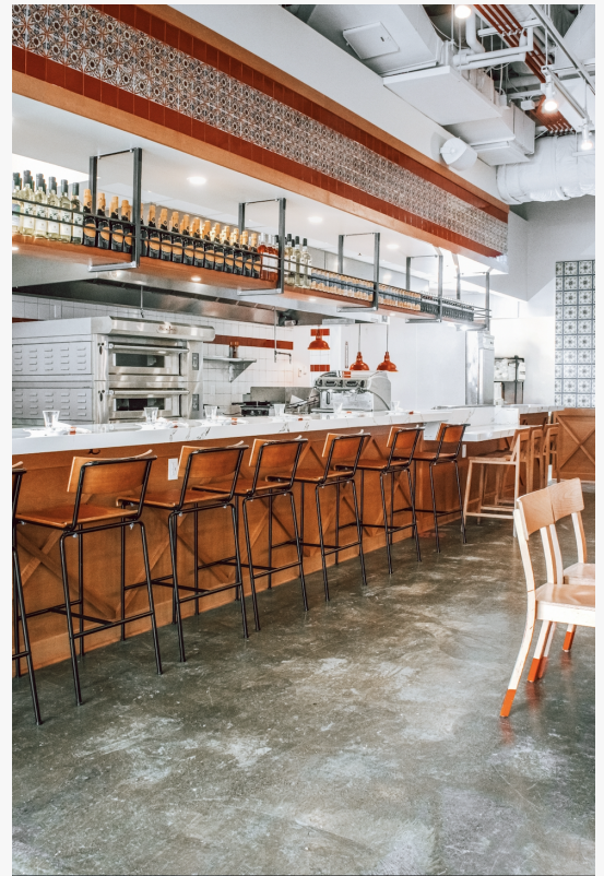
Stellina Union Market's Newly Expanded Space

In addition to debuting the new space, Stellina is excited to roll out a weekend brunch offering, available on Saturdays and Sundays from 10:00 a.m to 3:00 p.m. The brunch menu features a selection of classic brunch dishes with an Italian twist, such as Cacio e Pepe topped with a fried egg, Pasta alla Carbonara with homemade tonnarelli, eggs, guanciale, pecorino romano, toasted