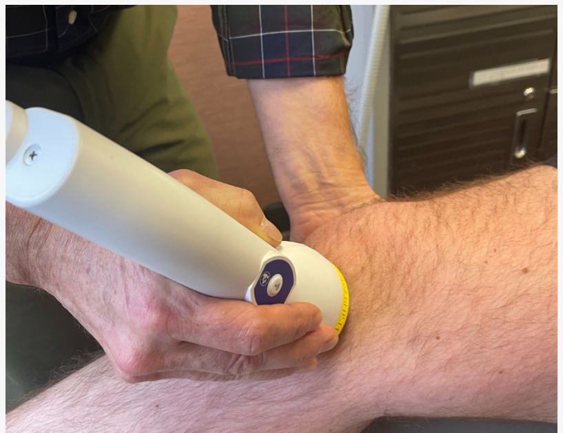
Softwave Therapy In Use - Knee

Located in Edina, MN, Chiropractic Health and Wellness provides a comprehensive range of services designed to address pain and improve mobility. Combining evidence-based chiropractic care with advanced therapies such as SoftWave™ Therapy, the clinic offers patient-centered solutions to achieve lasting health and vitality.