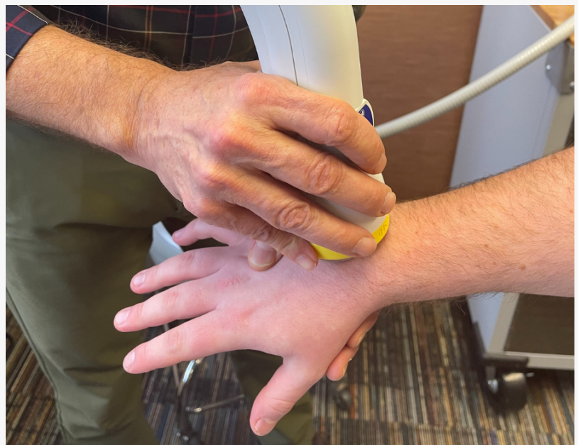
Softwave Therapy In Use - Wrist