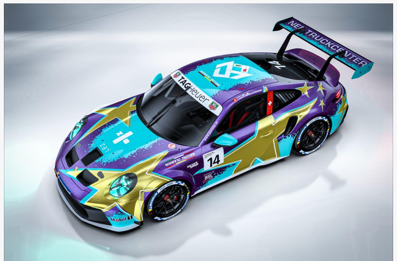
Racing is our blood since the beginning of it all

“This collaboration with Charlotte McLaren USA reinforces our mission to advance electric