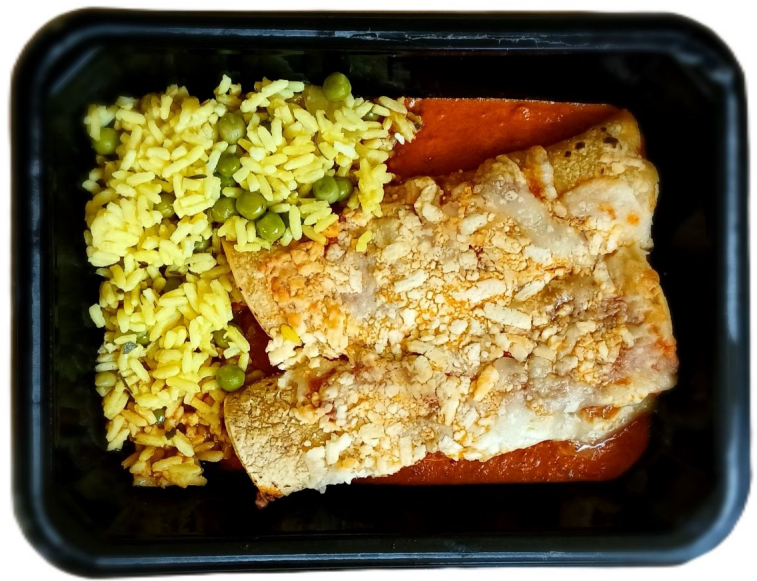
Demeter's Pantry Beef Enchiladas , Salsa Roja, with Rice