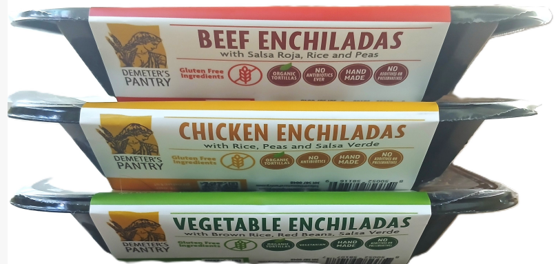
Demeter's Pantry new Enchiladas with Rice

This press release can be viewed online at: https://www.einpresswire.com/article/762257502