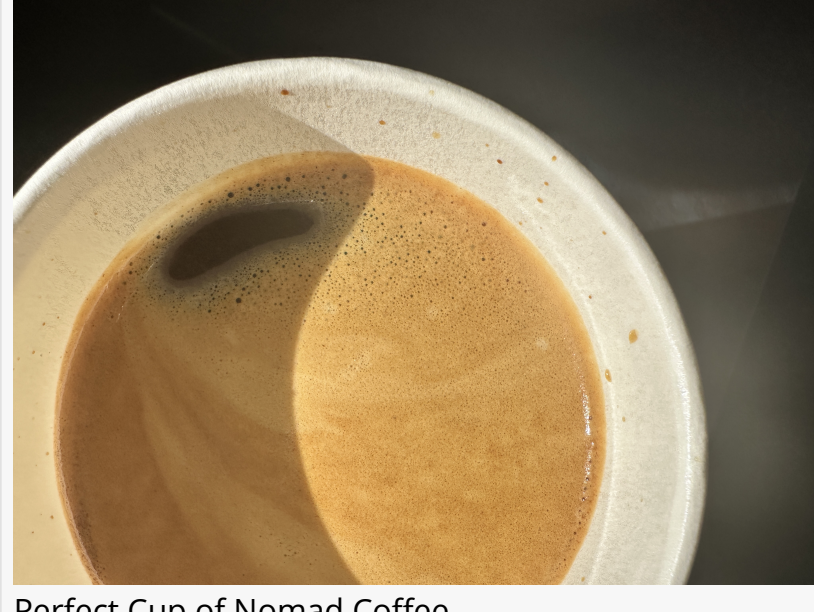
Perfect Cup of Nomad Coffee

offer additional menu items and host exclusive events. A highlight of the season is the "Sip, Savour, and Stroll" event, which invites guests to explore the lush lavender and sunflower fields with a gourmet charcuterie box and refreshing beverages in hand—a perfect blend of nature, taste, and seasonal celebration.