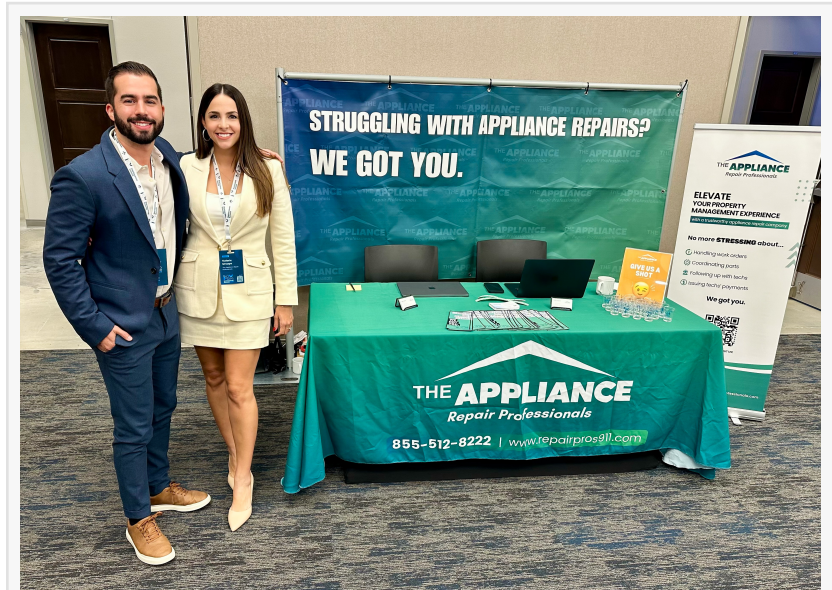
The Appliance Repair Professionals @ Property Meld's MX Summit

TEMPE, AZ, UNITED STATES, October 17, 2024 /EINPresswire.com/ -- The Appliance Repair Professionals have solidified their position as one of the leading appliance repair companies in the United States, proudly servicing over 40 states and completing more than 1 million repair jobs nationwide. The company, known for its industry expertise and outstanding service, has been endorsed by Kevin O'Leary, the renowned entrepreneur and investor from *Shark Tank* , further validating its excellence in the appliance repair market.