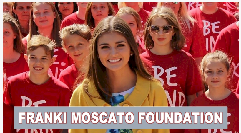
Franki Moscato Foundation

This press release can be viewed online at: https://www.einpresswire.com/article/738685821