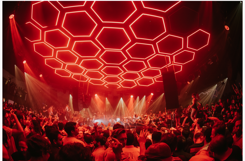
kinetic video rig designed by Audiotek for Pacha Ibiza

DUBLIN, IRELAND, May 21, 2024 /EINPresswire.com/ -- The recent release of the 2024 DJ Magazine Top 100 Clubs list has showcased the significant impact of Audiotek on the global clubbing scene. With an impressive 7% of the world's top clubs featuring installations designed and implemented by the company, including two within the top ten, Audiotek is rightly among the top AV design companies anywhere in the World.