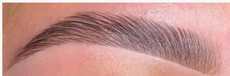
Keratin Brow Lamination

BROWLUSH's service offerings are at the cutting edge of the beauty industry. Microblading provides clients with naturally enhanced eyebrows through precise, semi-permanent pigment application, creating the appearance of fuller brows. Lash extensions are meticulously applied to enhance eye appearance with fuller and longer lashes that look natural yet striking. Lip blushing offers a semi-permanent makeup solution that enhances the natural lip color, improves definition, and gives the appearance of fullness. BROWLUSH's permanent makeup services provide a long-term solution for those looking to enhance their natural features with expertly applied makeup that requires little to no daily maintenance.