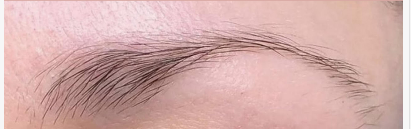
Microblading Westwood, CA