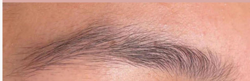
Keratin Brow Lamination