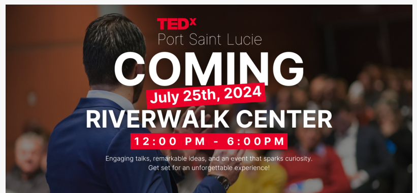
TEDxPort Saint Lucie Event Flyer

These esteemed sponsors exemplify a commitment to fostering community engagement and supporting initiatives that drive positive change.