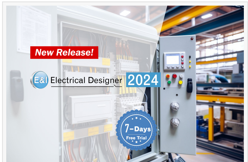
E&I Electrical Designer 2024