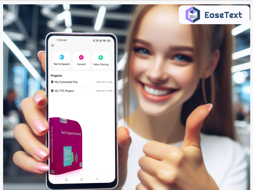
Text to Speech Converter for Android

App home page: https://www.easetext.com/text-to-speech-converter.html