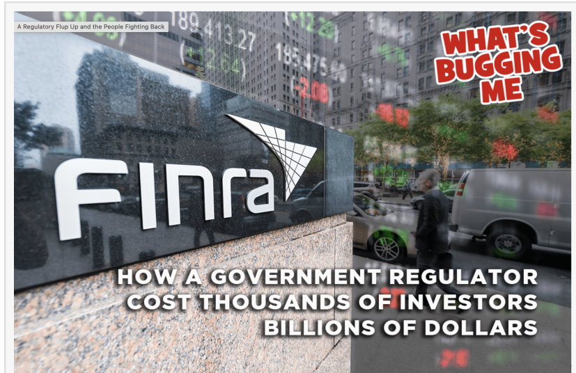
What's Bugging Me on the Ricochet Network and Apple Podcasts