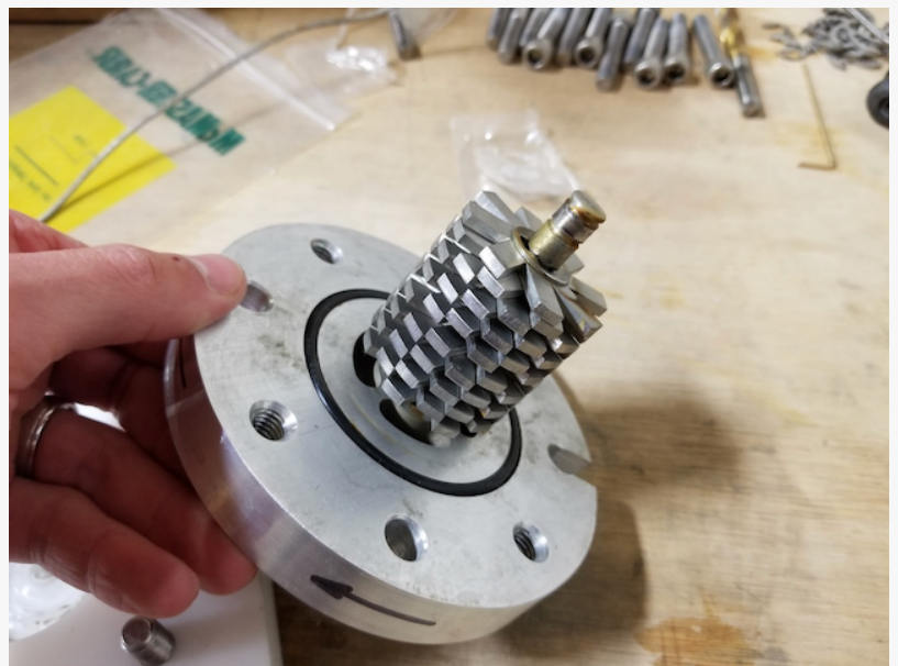
Infinity Turbine Cavitation Compressor Pump

MADISON, WISCONSIN, USA, December 1, 2023 /EINPresswire.com/ -- Infinity Turbine LLC announces a further expansion of its innovative heat pump turbine with integrated Cavgenx cavitation compressor pump, now encompassing absorption cooling and specialized cooling for AI data centers.