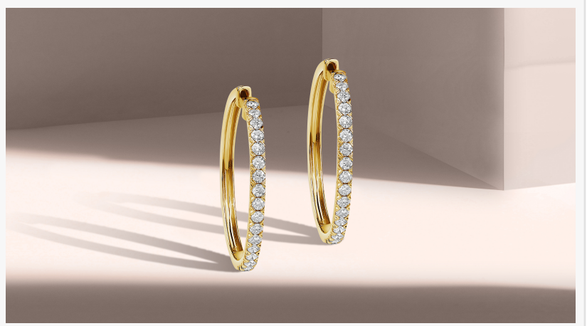
Hoop Earrings and many more..

The newly launched brand website, www.revelationdiamonds.com , serves as an intuitive interface that seamlessly integrates the brand's extensive collection of lab-grown diamond jewelry, including engagement rings, wedding bands, earrings, pendants, and more. The website also provides a platform for visitors to engage with a Rêvelation partner jeweler in their area, facilitating a more personalized and professional shopping experience.