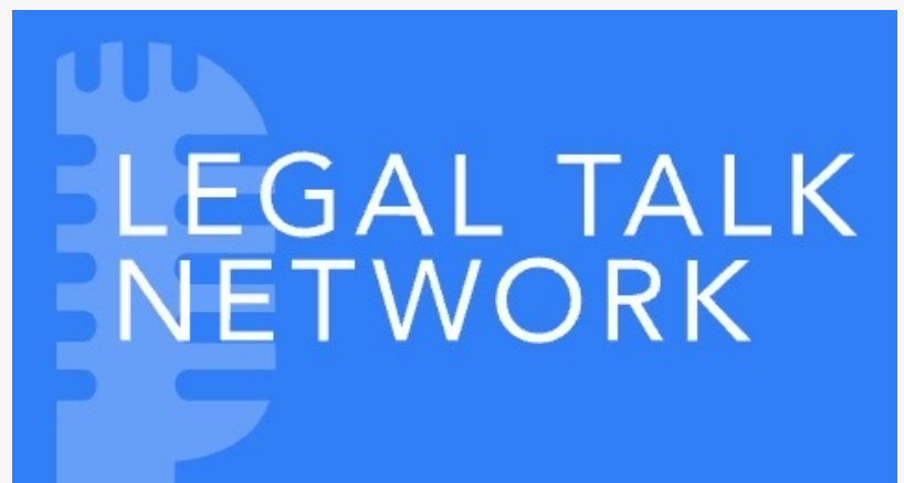
Legal Talk Network Logo