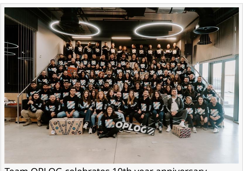
Team OPLOG celebrates 10th year anniversary

LEIGHTON BUZZARD, ENGLAND, November 27, 2023 / EINPresswire.com/ -- Celebrating its 10th anniversary, OPLOG, a leading tech-enabled omnichannel fulfillment provider, proudly marks a milestone year, dubbed the "Global Expansion Year." This significant event highlights OPLOG's dedication to evolving according to the needs of omnichannel fulfillment, underscoring its status as a global logistics powerhouse with a