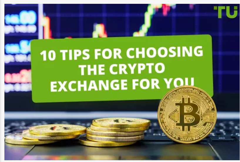
10 tips for choosing the best crypto exchange

Traders Union Secures the Title of 'Best World Financial Trading Portal 2023'