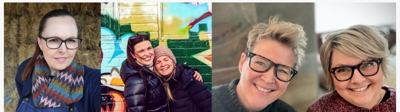
knit for the girls fundraising team - Thread & Maple, Louie & Lola Yarns and the Grocery Girls Knit