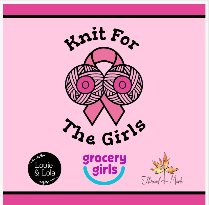
knit for the girls fundraiser

This October, the fundraising team are also hosting a worldwide knit-along for breast prosthetics