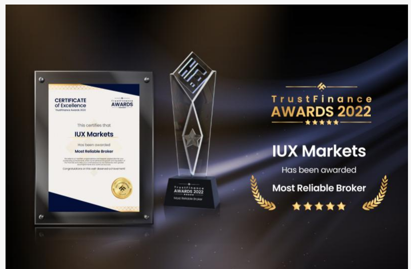
IUX MARKETS Awards