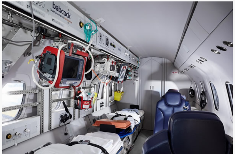
International LifeLine™ offers reliable emergency response services to customers worldwide.