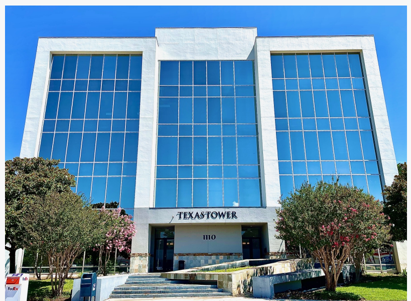
The US Based 24/7 Lifeline Response Center