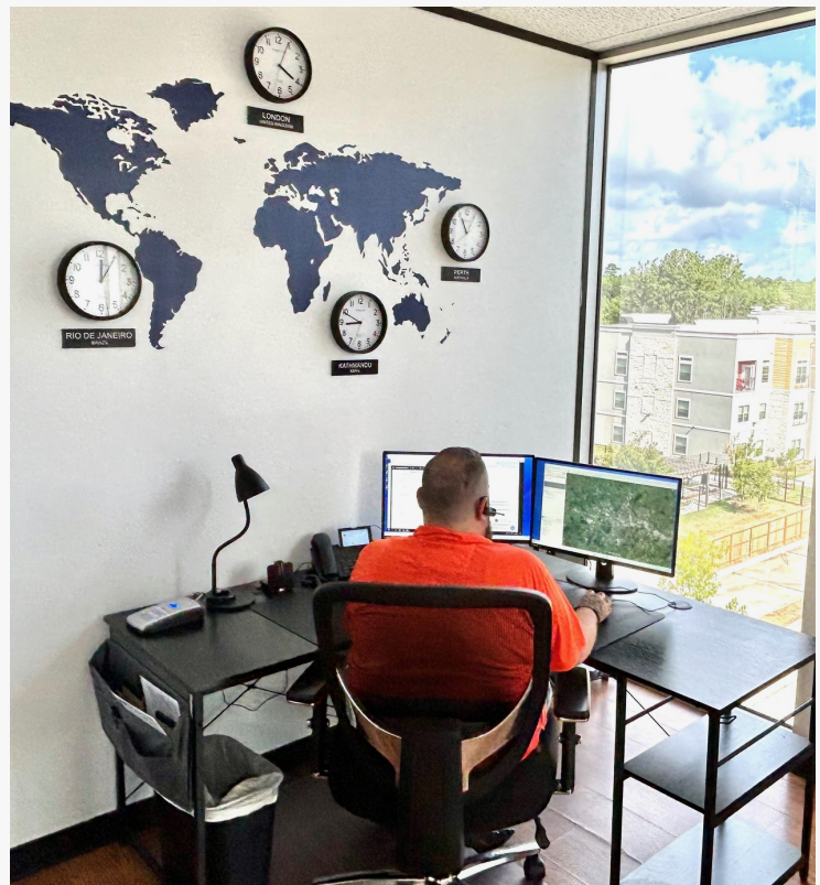
International LifeLine™ provides reliable emergency response services to customers worldwide.

This press release can be viewed online at: https://www.einpresswire.com/article/654351625