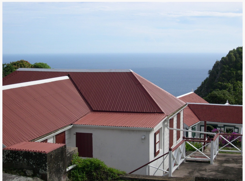
New metal roof