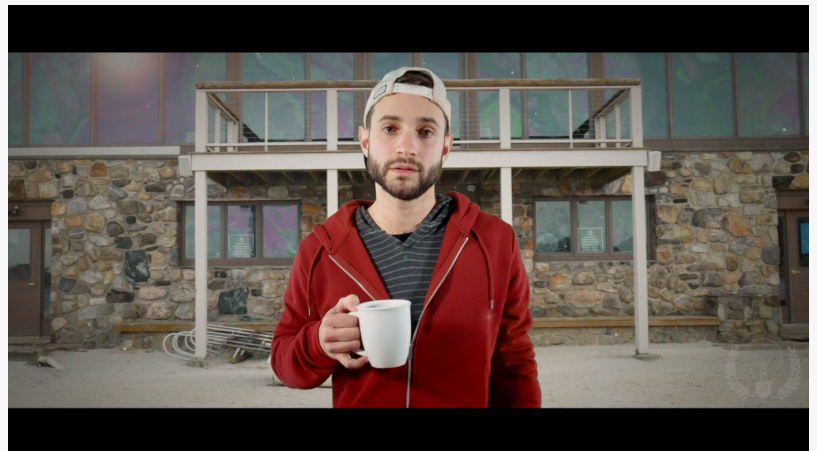
Scene from 'SECRETS'