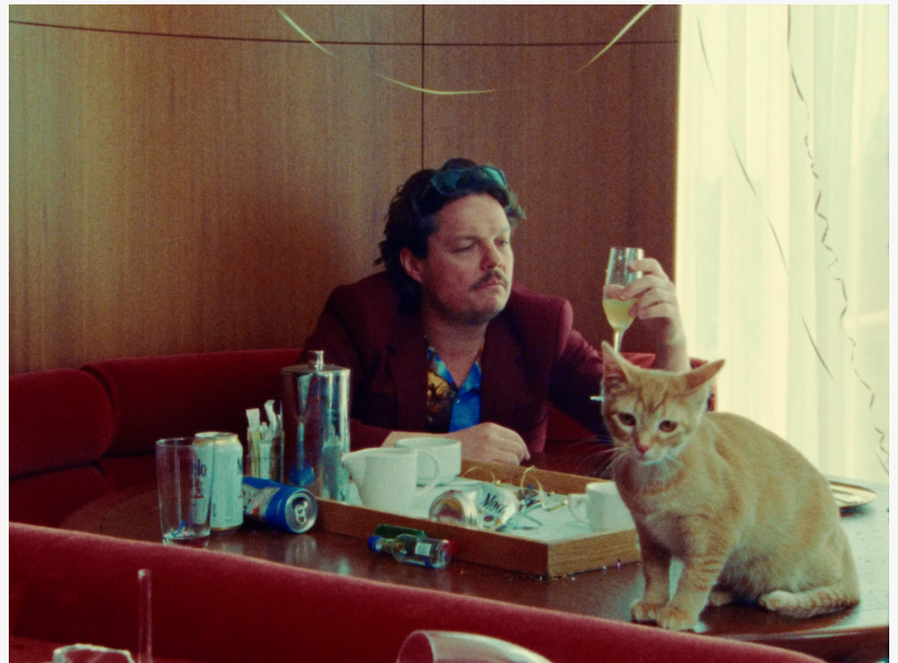
Scene from MANGO GARRY