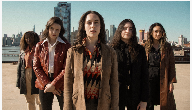
Scene from 'WATCHDOG'