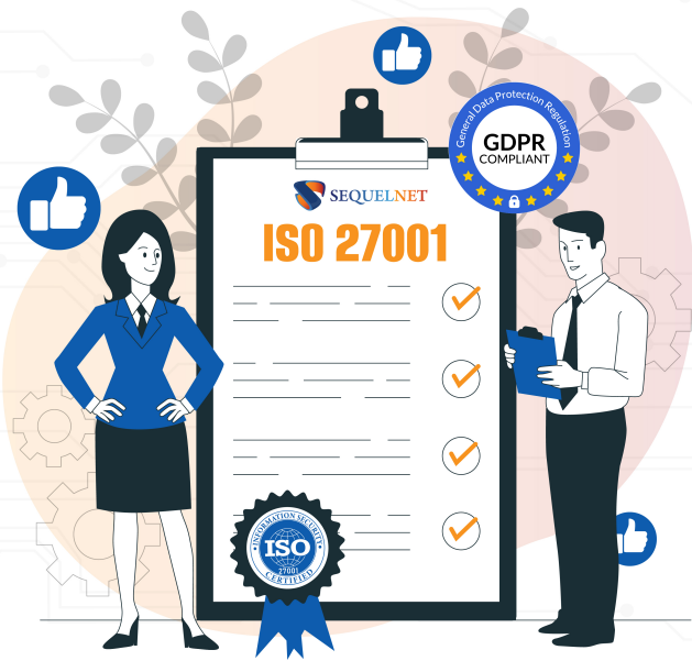
Compliance ISO 27001, GDPR

In addition, managed service providers can help businesses scale their operations quickly and efficiently. As an organization grows, its IT needs will inevitably change, and an MSP can help