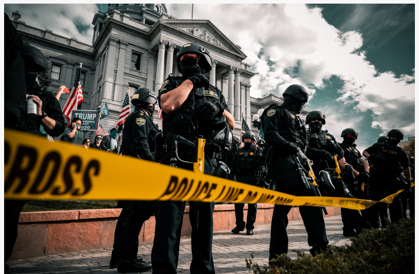
With the news that there have been 100 mass shootings in the United States since the beginning of 2023, few subjects have aroused as much passion or controversy as the solution for violence.