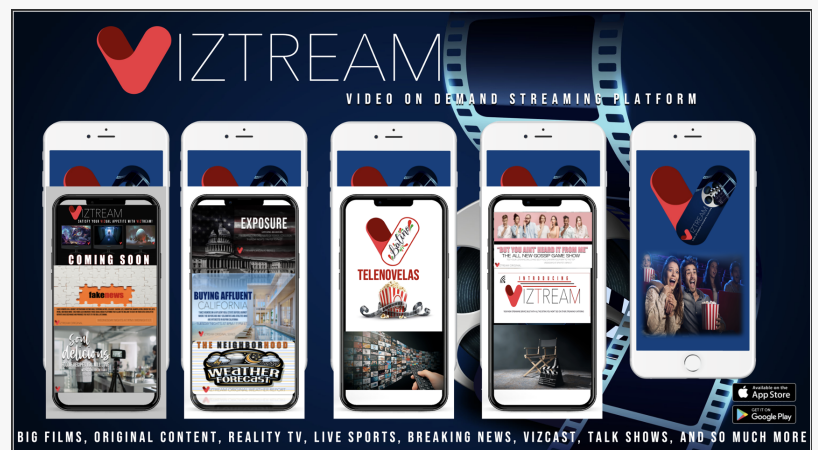
Download in the App Store