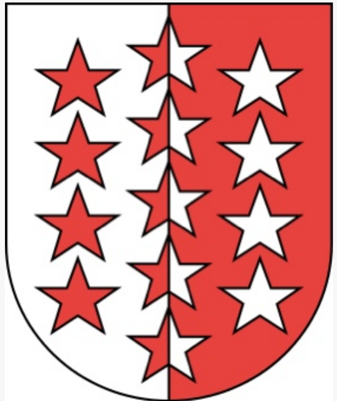
Stars of Wallis