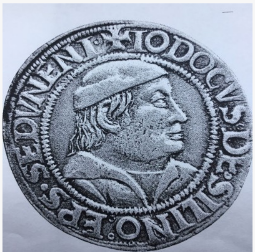
Jost von Silenen