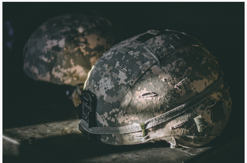
There are solutions that don't involve unproven and dangerous drug treatments.