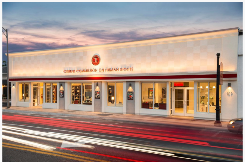
The headquarters for CCHR Florida are located in downtown Clearwater.

About CCHR: Initially established by the Church of Scientology and renowned psychiatrist Dr. Thomas Szasz in 1969, CCHR's mission is to eradicate abuses committed under the guise of mental health. The Florida chapter of CCHR is an award-winning nonprofit in the area of mental health human rights and government relations. L. Ron Hubbard, founder of Scientology, first brought psychiatric imprisonment to wide public notice: "Thousands and thousands are seized without process of law, every week, over the 'free world' tortured, castrated, killed. All in the name of 'mental health,'" he wrote in March 1969.