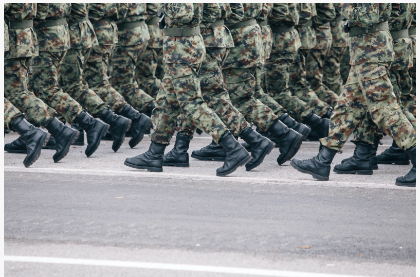
Although a direct correlation cannot be made to account for all the suicides, it can be said that the standard treatment of psychiatric drugs has not helped reduce the plight of veterans and soldiers who are suffering.