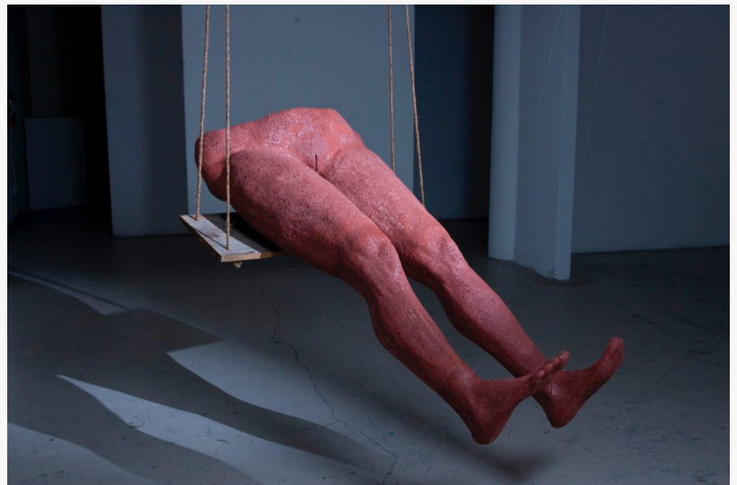
Pritika Chowdhry. "What the Body Remembers," 2008. Paper pulp, mason stains. 6 ft. x 3 ft. x 10 ft. installed dimensions.