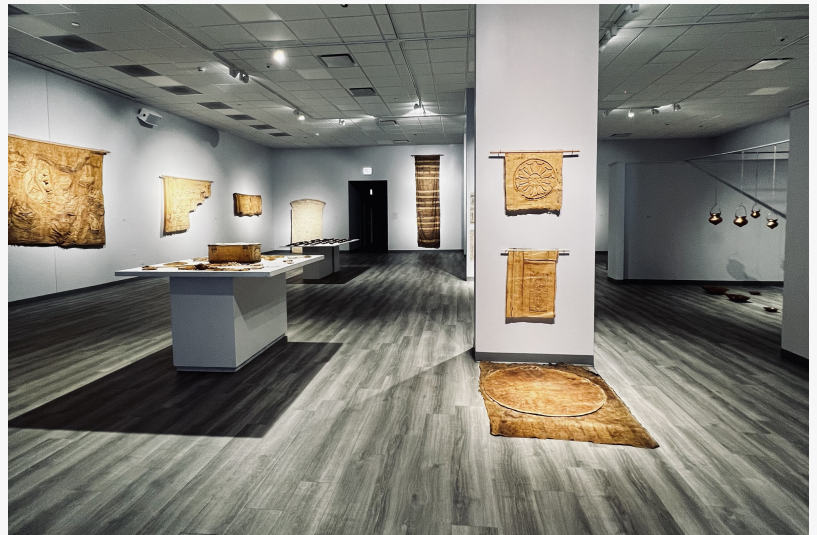
Installation view of the Broken Column at the South Asia Institute, Chicago as part of the exhibition "Unbearable Memories, Unspeakable Histories"