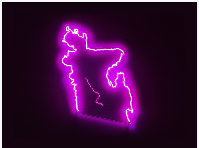
Radcliffe Line East defined East Pakistan, which became the India-Bangladesh border in 1971