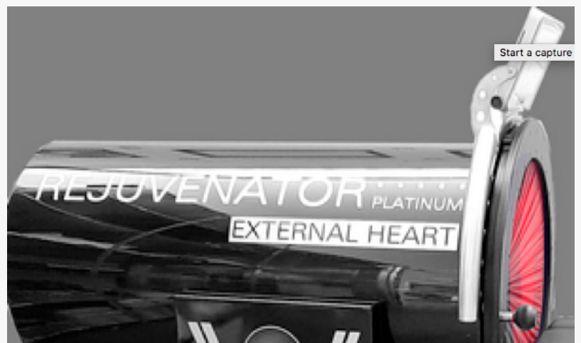
Rejuvenator Platinum ***** EXTERNAL HEART

SHERIDAN, WYOMING, UNITED STATES OF AMERICA, November 29, 2022 /EINPresswire.com/ -- WellCelerators LLC reports a case study made with intermittent Vacuum Therapy and its effects on the rehabilitation of 50 professional athletes consisting of canoeists, swimmers, rowers, footballers, tennis players and track-and-field athletes.