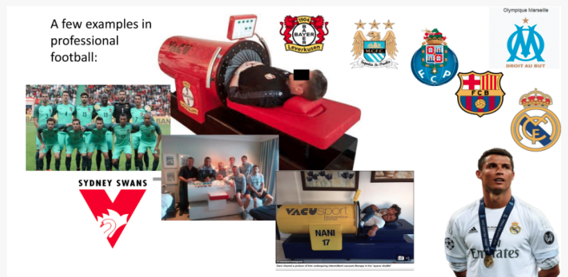
Soccer Athlete Regeneration Machine